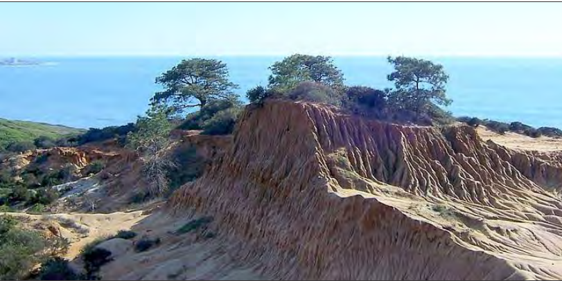
View from Broken Hill overlook

Reserve's longest trail, including access to the beach. Features chaparral, few trees, and scenic overlook pictured below.